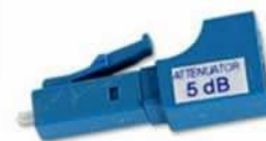
Example of a Fixed Attenuator (doped fiber with metal ion)

Equalize Channel Strength in a Multi-Wavelength System